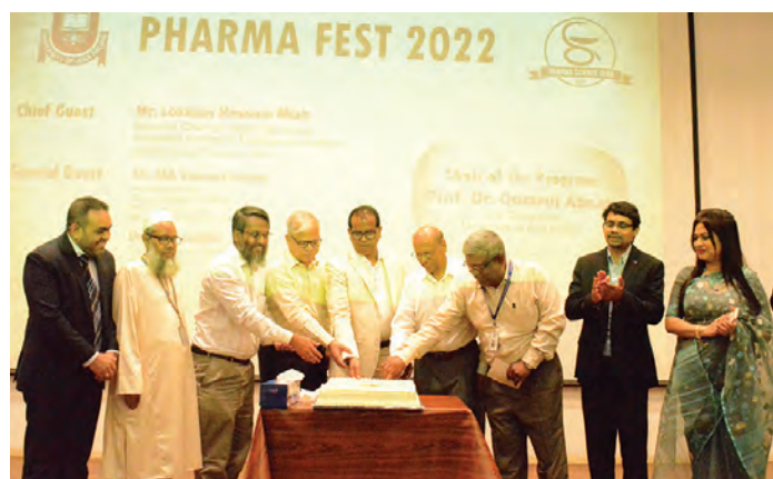
Pharma Fest-2022 held at UAP

The Pharma Science Club (PSC) of the Department of Pharmacy, UAP was delighted to present the Pharma Fest on October 22, 2022, after a two-year hiatus caused by the Covid-19 crisis. With the view of creating a common platform for the exchange of ideas among pharmacy students from different universities and delegates from renowned pharmaceutical companies, the Pharma Fest is considered one of the major gateways for students to get exposure to the premise outside of UAP.