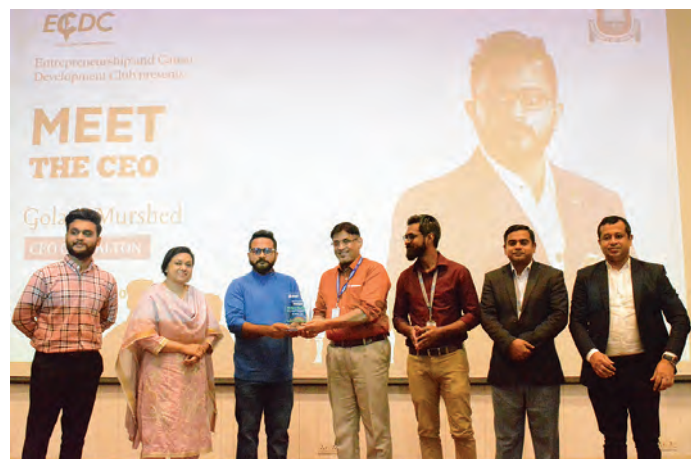
ECDC organized 'Meet The CEO'- Spring 2022