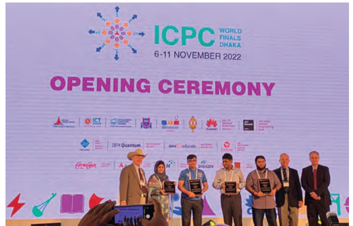
UAP CSE Faculty Receives ICPC Foundation Outstanding International Contribution Award